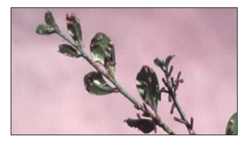
Fig. 2. Asian citrus psyllids on Murraya paniculata.