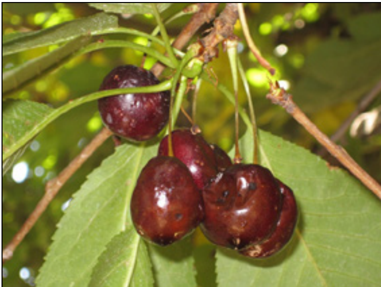
Figure 3. Cherries damaged by Drosophila suzukii .