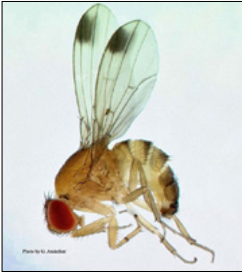
Figure 1. Drosophila suzukii male

Uchino, K. 2005. Distribution and seasonal occurrence of cherry Drosophila , Drosophila suzukii (Diptera: Drosophilidae), injurious to blueberry in Chiba Prefecture. Annual report of the Kanto Tosan Plant Protection Society 52: 95-97. University of California Cooperative Extension, Mariposa County. Be on the look out for spotted wing Drosophila . http://cemariposa.ucdavis.edu/files/67726.pdf , viewed 24 July 2009. van der Linde, Kim. 2009. Zaprionus indianus distribution in the United States. http://www.kimvdlinde.com/professional/Zaprionus%20distribution%20US.html , viewed on 30 July 2009.