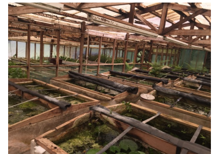
Aquatic Plant Greenhouse

Persons interested in starting a nursery or farm for commercial production and sale of aquatic plants must apply for an Aquaculture Certificate of Registration and comply with Chapter 5L-3, F.A.C. and Best Management Practices (BMPs) in accordance with Chapter 597 F.S. The Division of Aquaculture reviews and inspects all aquaculture facilities and production practices, including aquatic plants to ensure compliance with all aspects of the BMPs.