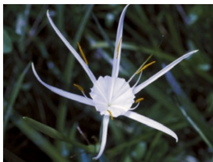
Fig. 11: Hymenocallis crassifolia (coastal plain spider lily).