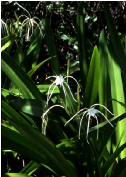
Fig. 13: Hymenocallis latifolia (mangrove spider lily).