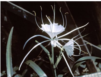
Fig. 5: Hymenocallis tridentata (Florida spider lily).

H. choctawensis Traub (Fig. 8) has rhizomes and thick-textured, shiny green leaves. The bracts at the top of the scape are 3 to 4.7 cm long, with acute, but not long acuminate, tips. This species grows in floodplain swamps from the Apalachicola River westward in the Panhandle. It blooms earlier than H. occidentalis , from April to June, with the leaves remaining green long afterward. The newly discovered species, H. gholsonii (Fig. 9), is very similar to H. choctawensis , but differs in several ways, for example, in having larger staminal cups, larger bracts, narrower, strap-shaped leaves and robust bulbs (Smith and Garland 2009; Wunderlin and Hansen 2011). It is known only from Liberty County.