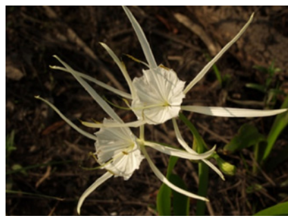
Fig. 9: Hymenocallis gholsonii (Gholson's spider lily).