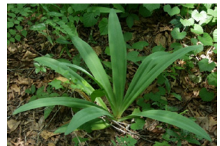
Fig. 7: Hymenocallis occidentalis (northern spider lily) leaves.