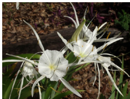
Fig. 6: Hymenocallis occidentalis (northern spider lily) flowers.