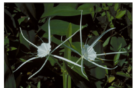
Fig. 12: Hymenocallis franklinensis (cow creek spider lily).