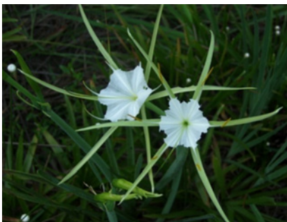
Fig. 2: Hymenocallis henryae (Henry's spider lily).

H. godfreyi G. Lom. Sm. & Darst (Fig. 4) is smaller than H. rotata , with two flowers per scape, each bearing a staminal cup 4 to 6 cm in diameter, and with erect leaves no more than 40 cm long at the time of flowering. Unlike any other native spider lily, H. godfreyi produces rhizomes from the bottom of the bulb, rather than from its side. This is a rare plant of coastal marshes in Wakulla County and is included on Florida's list of endangered plants (Weaver and Anderson 2010). This species blooms in early spring, from March to May, particularly after fire.