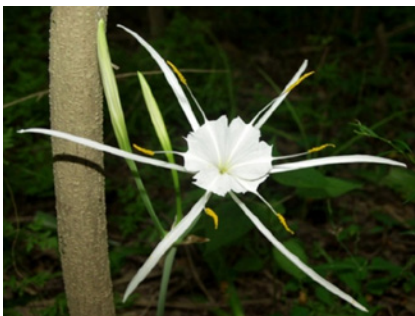
Fig. 8: Hymenocallis choctawensis (Florida panhandle spider lily).