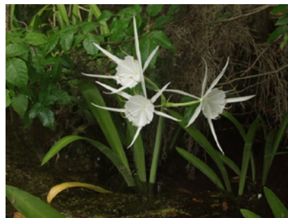
Fig. 3: Hymenocallis rotata (spring-run spider lily).