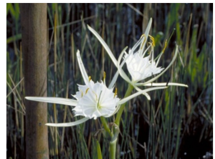
Fig. 4: Hymenocallis godfreyi (Godfrey's spider lily).