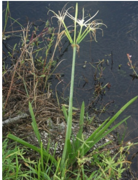
Fig. 14: Hymenocallis puntagordensis (small cup spider lily).