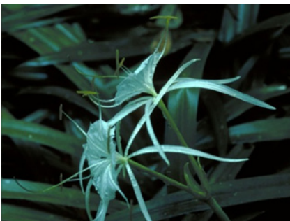
Fig. 10: Hymenocallis duvalensis (white-sands spider lily).

H. puntagordensis Traub (Fig. 14) is little-known. It has thick and stiff, shiny green, almost erect, narrow leaves that are 35 to 75 cm long and 1.5 to 3 cm wide and has three to five flowers on each scape. Unlike H. latifolia and many tropical spider lilies, it has yellow pollen. Its ovaries are large, 1.5 to 2.4 cm long and 10 mm wide, with five to nine ovules in each locule. In the field, its long narrow leaves, its particularly small staminal cup with prominent projections on its edge, and its stamens with particularly long green filaments are distinctive. So far, it has been found on a few roadsides and ditches near Punta Gorda in Charlotte County, always in association with H. palmeri . This species blooms in August.