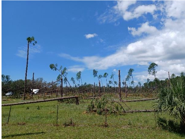
Figure 2 Catastrophic damage of a pine stand in Taylor County following Hurricane Idalia.

Following landfall, maps were prepared using available wind speed data to calculate potential affected areas. These maps were further refined using available aerial imagery, aerial surveys, and ground reconnaissance. Damage estimates are based on categories listed as catastrophic, severe, moderate, and light based on wind speed estimates, modeling, and observations. Catastrophic damage are forests showing more than 50% of a stand being altered, damaged, or destroyed. Severe damage was assigned to forests having between 33% and 50% damage. Moderate damage was assigned to forests having between 25% and 33% damage. Light damage was assigned to forests having less than 25% damage.