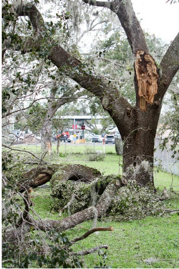
Figure 5 Photo showing tree damage caused by Hurricane Idalia. Many mature live oaks experienced significant damage.