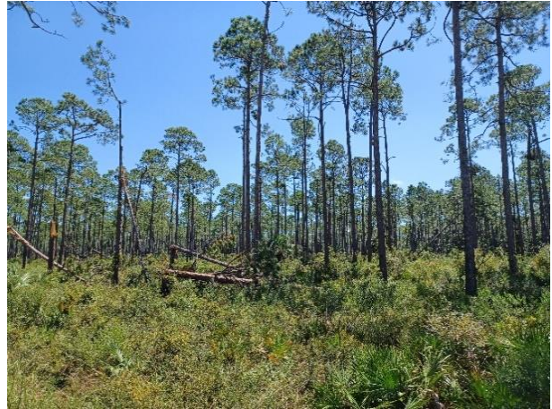
Figure 3 Light damage of a pine stand in Taylor County following Hurricane Idalia.

A team of Florida Forest Service employees utilized the ESRI applications Survey123 and Field Maps to collect and document ground observations. A two kilometer by two kilometer grid layer was included in the map and the team attempted to log an observation point in as many grid squares as possible to get a representative sample of the impact area. Each time a survey point was taken, a team member recorded the time, date, and location of the point as well as the primary forest type and the timber damage category: catastrophic, severe, moderate, light, or none. The Florida Forest Service team was able to collect a total of 792 survey points within the six-county area closest to the path of Hurricane Idalia.