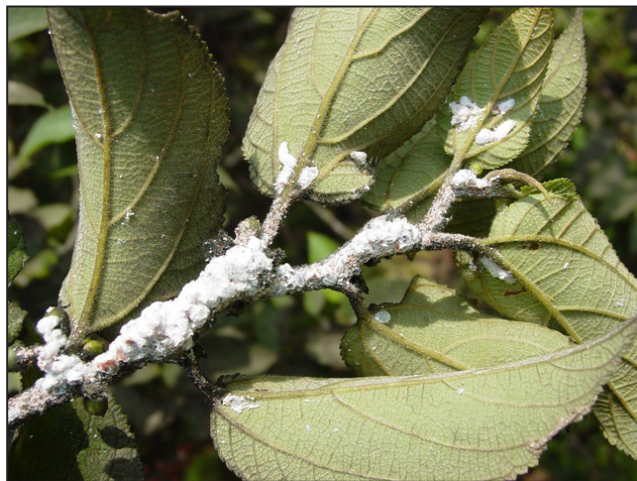
Maconellicoccus hirsutus (Green)-on Florida triema.