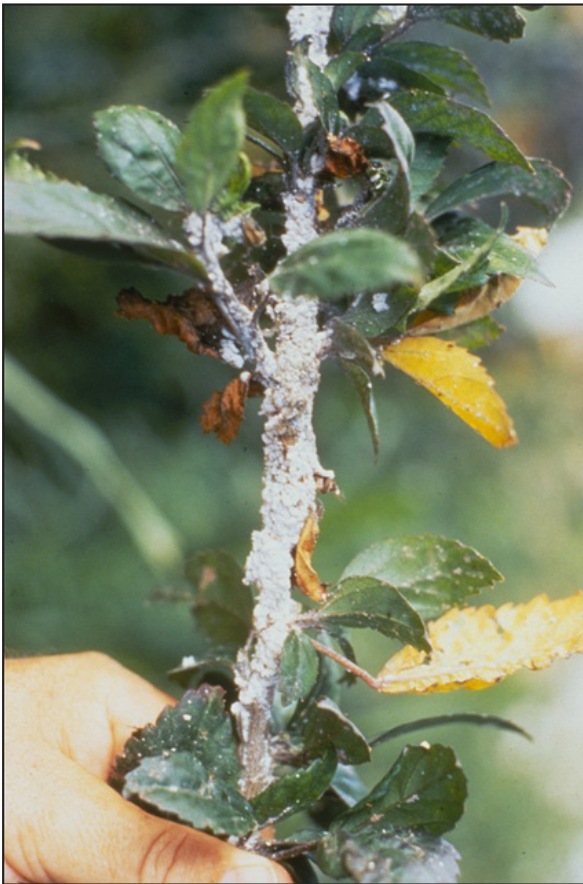
Heavy PHM infestation on hibiscus plant in South Florida.