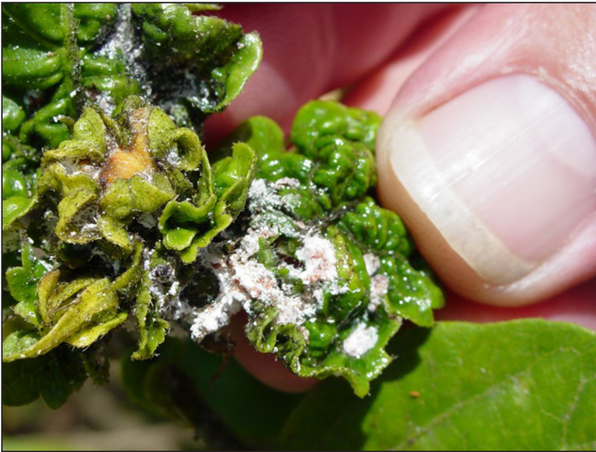
Maconellicoccus hirsutus (Green)-'bunchy top' damage.