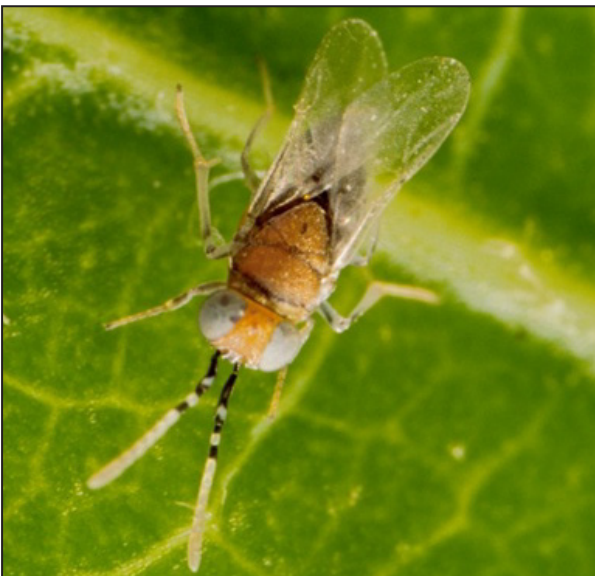
Wasp-like parasite, Anagyrus kamali .