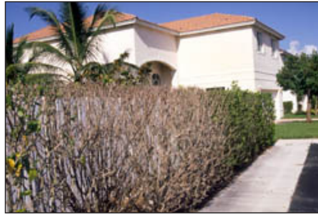
Severe hedge damage caused by PHM.